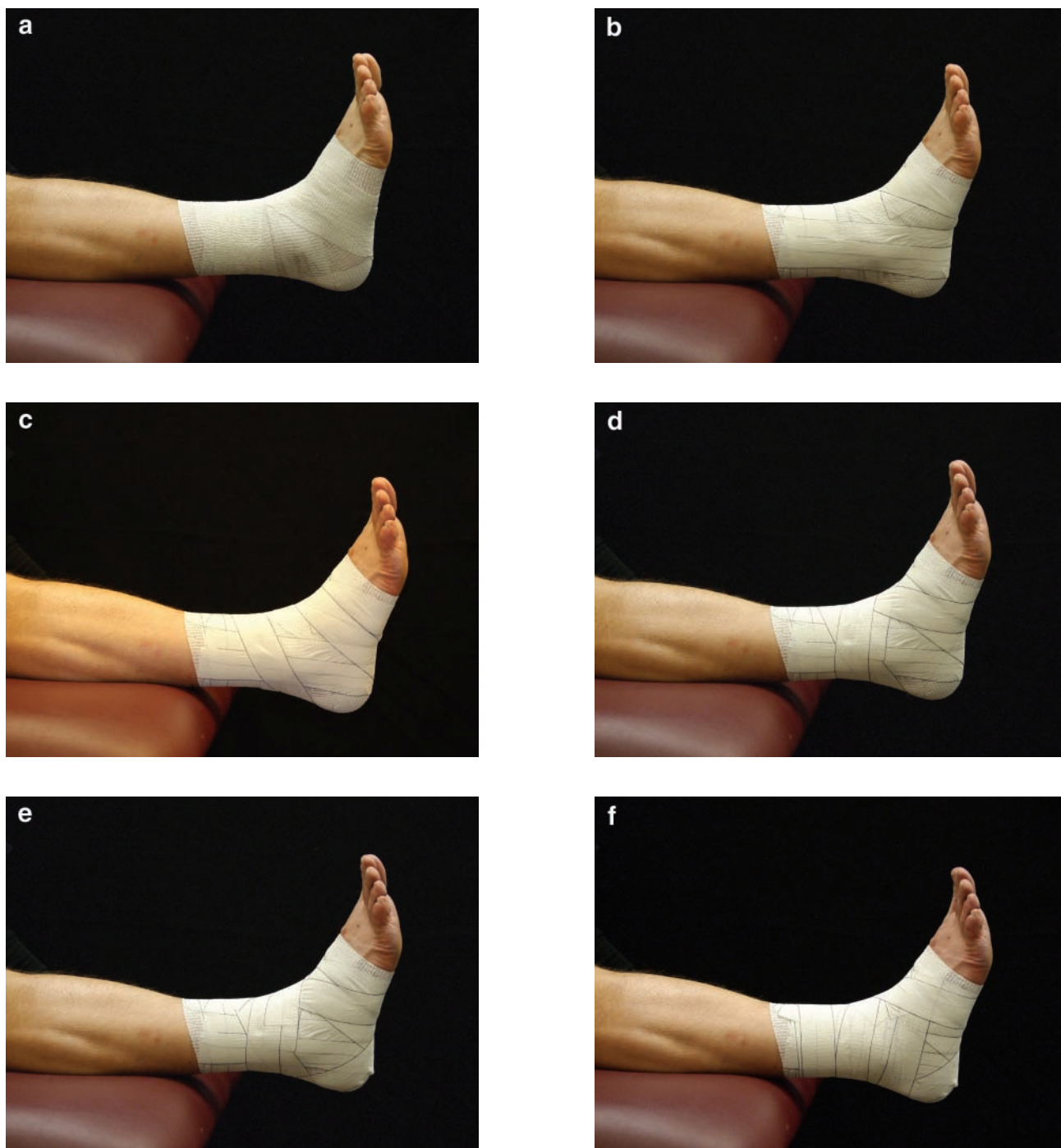
Figure 2. Self-adherent tape condition: a, self-adherent prewrap applied; b, 3 stirrups; c, lateral heel lock; d, figure-of-8; e, medial heel locks; and f, completed.