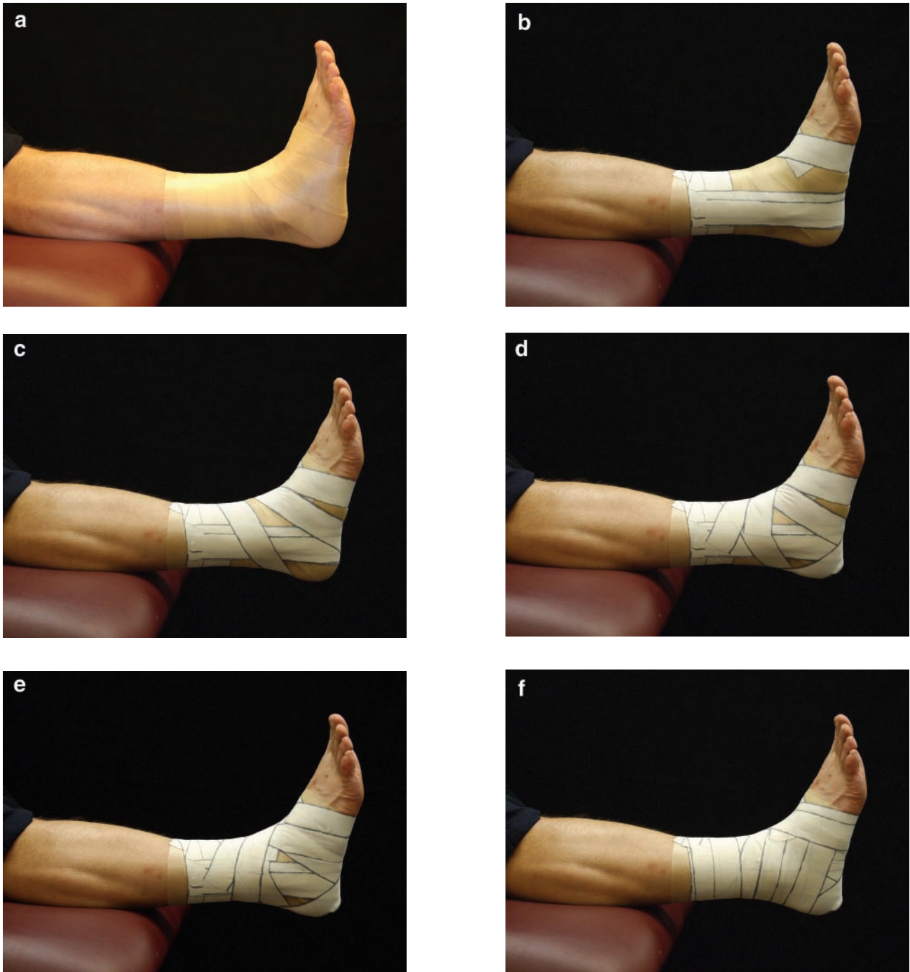
Figure 1. White cloth tape condition: a, prewrap; b, 3 stirrups; c, medial heel lock; d, lateral heel lock; e, figure-of-8; and f, completed.

dorsiflexion–plantar flexion range of motion on 2 separate days. The intraclass correlation coefficient (ICC) formula (2,k) was used to evaluate the data. For inversion–eversion range, the ICC was 0.87 (standard error of the mean [SEM] = 2.51°) and for dorsiflexion–plantar flexion range the ICC was 0.99 (SEM = 1.41°)